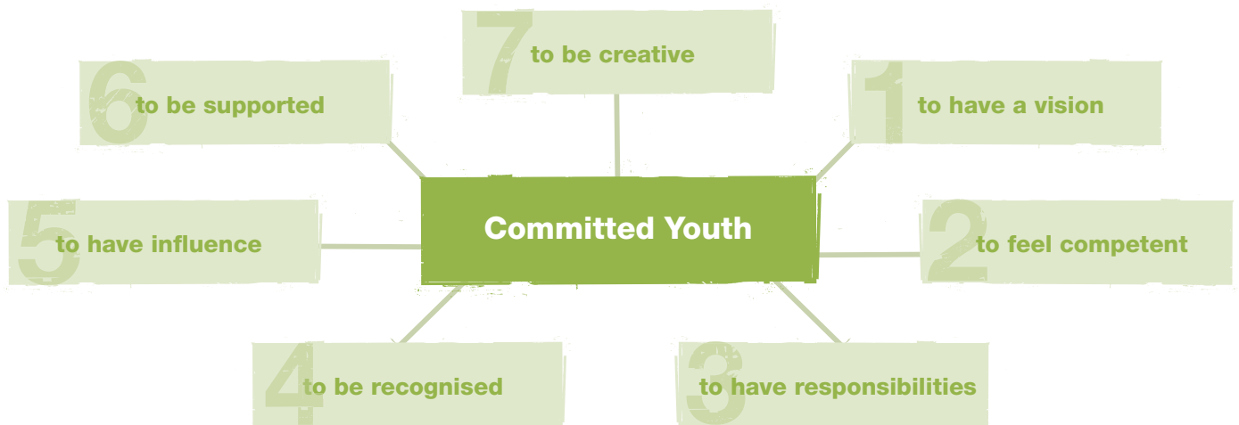
FIG. 4: THE SEVEN DRIVING FORCES BEHIND THE ENGAGEMENT OF YOUNG PEOPLE

We have noticed that when these seven forces are present, young people are more committed and their participation is maximised. When some of these elements are missing, youth engagement is more difficult and the results are less conclusive.