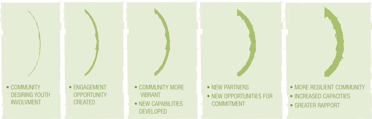
FIG. 1 AMPLIFIED IMPACT (WAVES)

To successfully mobilise youth, one will have to work in a variety of ways; sometimes things will be familiar, sometimes they will be different, and still, at other times, they will be completely innovative and require creativity.